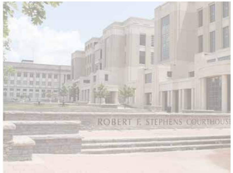
ROBERT F. STEPHENS COURTHOUSE

Fayette County Bar Association 219 N. Upper Street Lexington, KY 40507