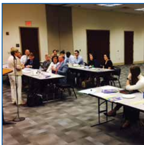
Attorney/judge training at Courthouse